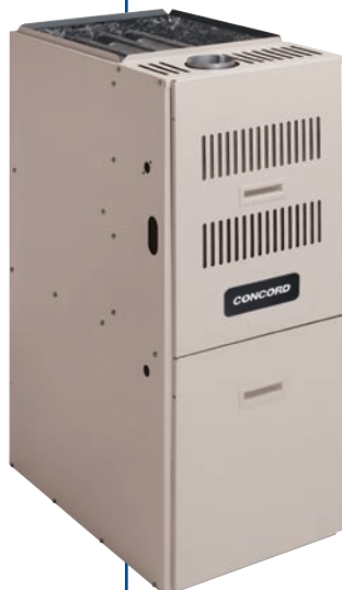
Approximate Five-Year Natural Gas Cumulative Energy Savings for 80% AFUE New Furnace vs. 60% Efficient Furnace †